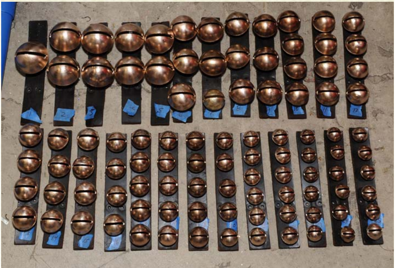
Fig 3. - Finished Set of Sleigh Bells