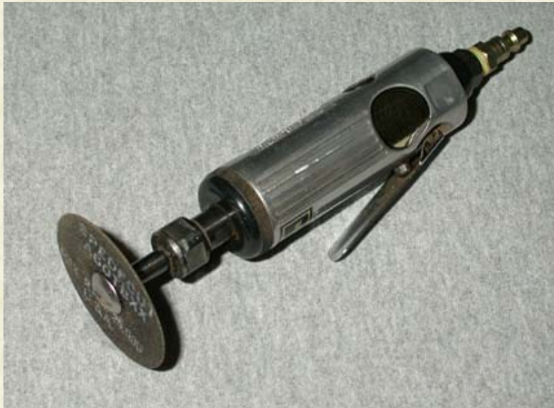
Fig. 1. - The CrotalMaster 3000

I used a die grinder ("The CrotalMaster 3000") as shown in Fig. 1 with an abrasive disc mounted in an arbor for metal removal.