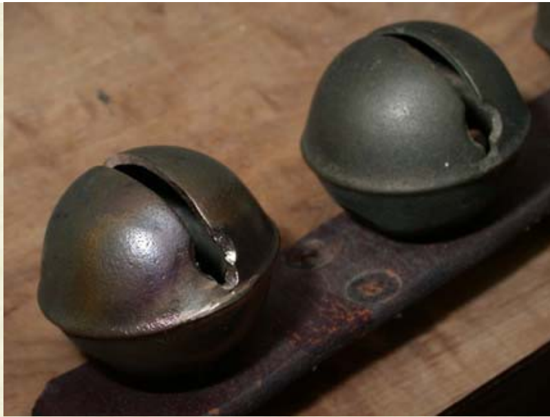
Fig 2. - Welded Crotal (on the left)